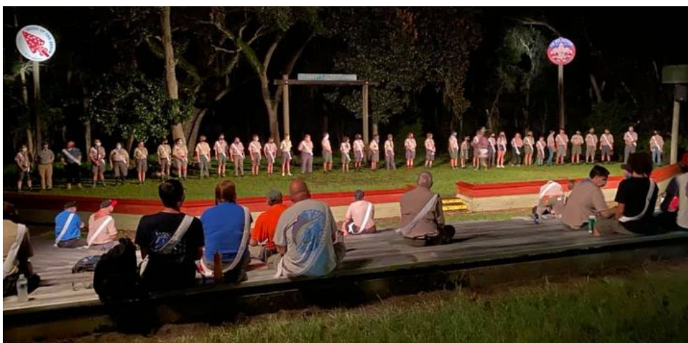
Brotherhood Callout at Fall Fellowship.

Fall Fellowship has been held for many years, yet this year's event was a first of its kind in multiple ways. For one, this was the first major in-person event the lodge has